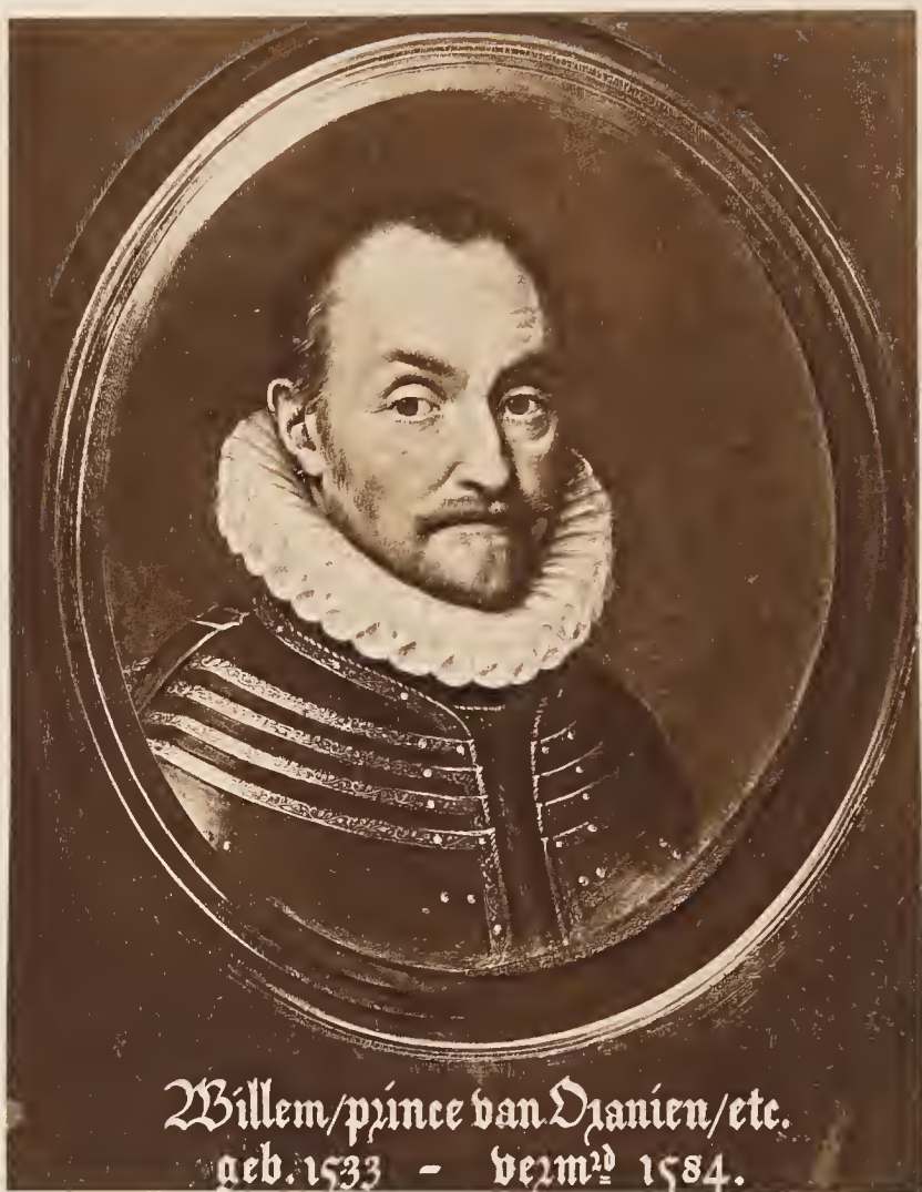
Willem/prince van Oranien/etc. geb. 1533 - verm d 1584.